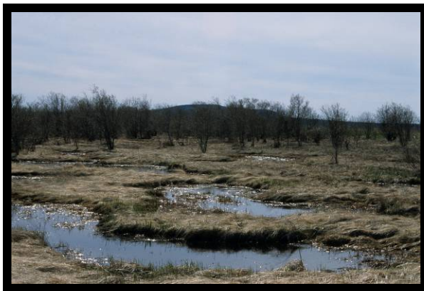
FIGURE 4. Representative thicket swamp breeding habitat of Pseudacris maculata in Baie Boatswain, Québec (station R20).

Together, P. maculata and A. americanus , L. sylvaticus , and/or P. crucifer breed in fish-free habitats. We captured five adult P. maculata during the day (Table 3) and observed one amplexing pair. Mean snout-vent and right tibiafibula lengths for these adults were 32.1 mm ± 3.4 (SD) and 11.7 mm ± 0.9, respectively. When positioned for photographic documentation, a female released 384 eggs, suggesting that resident gravid females at these sites were primed for egg deposition. However, we did not find egg masses or tadpoles in the field. We deposited the five