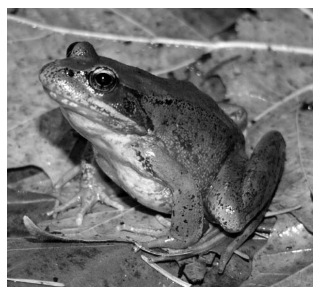
Fig. 1. Adult female Northern Red-legged Frog ( Rana aurora ) encountered during fall pre-ovewintering migration in a partly developed forested landscape, West Olympia, Washington, October 2005.

Postmetamorphic life stages are occasionally observed in aquatic habitats during the non-breeding season (Schuett-Hames 2004). Adults may also overwinter in aquatic habitat, especially when temperatures are colder (Ritson and Hayes 2000). Overwintering data on R. aurora remain sparse, but these patterns