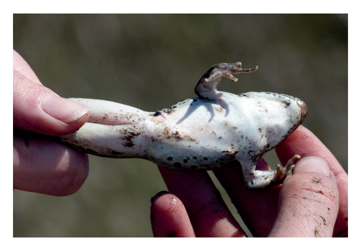
Figure 5. Northern leopard frog (Lithobates pipiens) observed 14 days after release following placement of intracoelomic radiotransmitter and external PSD. Radiotransmitter implantation incision is clearly visible and appears to be healing well. PSD is no longer attached (Photo courtesy of Clay Pierce).

frog had several single suture failures of unknown cause and were found dangling from the ventral skin of the frog.