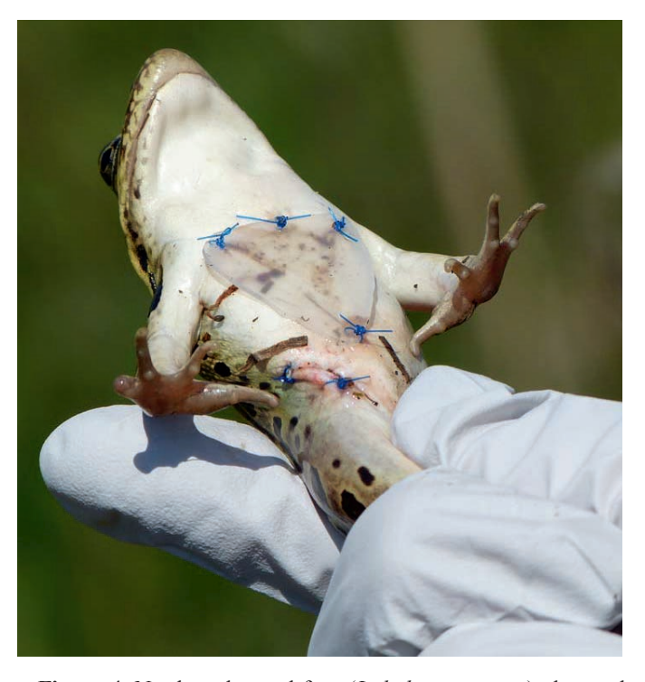
Figure 4. Northern leopard frog (Lithobates pipiens) observed seven days after release following placement of intracoelomic radiotransmitter and external PSD. Radiotransmitter implantation incision and PSD are clearly visible and sutures all appear intact.

One frog (5%) was found dead on the third day after release; suture failure at the transmitter implantation incision was the probable cause. One week after release, all 19 remaining frogs were recaptured for visual assessment of surgical wounds, sutures, and PSDs. PSDs were attached to all 19 frogs (Fig. 4), and surgical sites appeared to be healing well other than a minor amount of erythema around the incision sites. The PSD on one