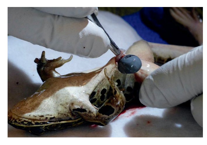
Figure 1. Placement of a radiotransmitter into the coelomic cavity of a northern leopard frog (Lithobates pipiens).

Radiotransmitter placement: Radiotransmitters (17 \times 8.5 \times 5.5 mm, 1.8g; Holohil BD-2H, Holohil Systems Ltd., Carp, Ontario, Canada) were first sterilized by immersion in 70% ethanol for 3 min, dried with sterile Kimwipes (Kimwipes, Kimtech-Kimberly Clark Professional, Roswell GA), and were rinsed with sterile saline. Frogs were positioned in dorsal recumbency on two sponges soaked with lactated Ringer's solution once a surgical level of anesthesia was obtained. A surgical