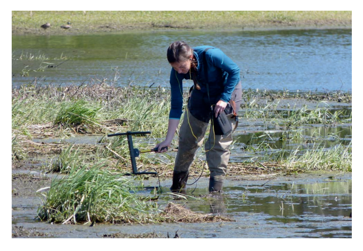
Figure 3. Attempts were made to visualize frogs daily with the use of radiotelemetry.

There were no surgical complications encountered during this project. Time to appropriate anesthesia was highly variable