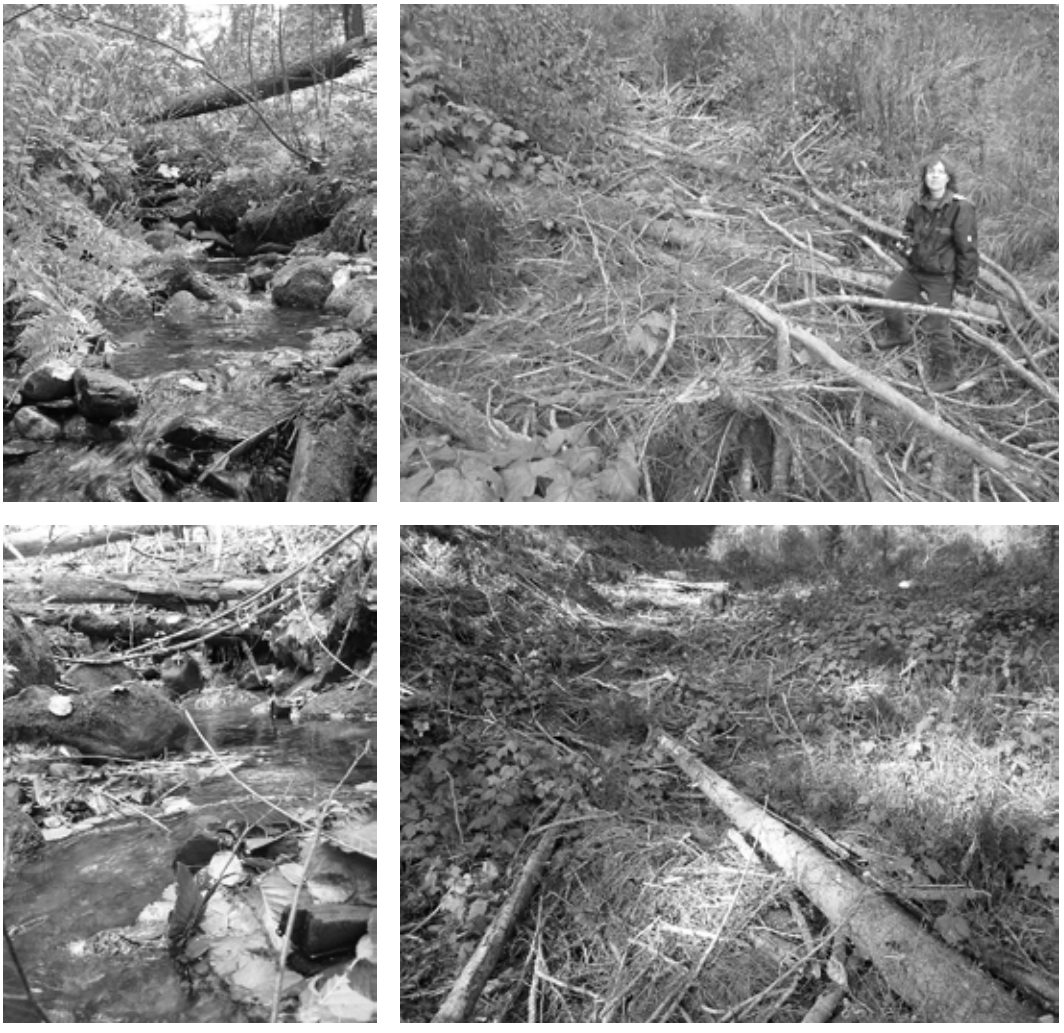
Figure 2. In-stream habitat before (left, 2006) and after (right, 2013) logging at the south-facing tributary of the Hurley River where Coastal Tailed Frog tadpoles were found on 5 October 2006.

In 2006, a total of 45 Coastal Tailed Frog tadpoles was detected at the four stations surveyed in the unnamed south-facing tributary (Table 1, Appendix 1). This stream was the smallest of those surveyed and was approximately 1 m wide, had an anchored cobble/ gravel substrate with stepped pools, and flowed at a 14% gradient through a steep-sided gully at 1100 m elevation. It was heavily overhung with woody debris and vegetation (Figure 2) under a mature