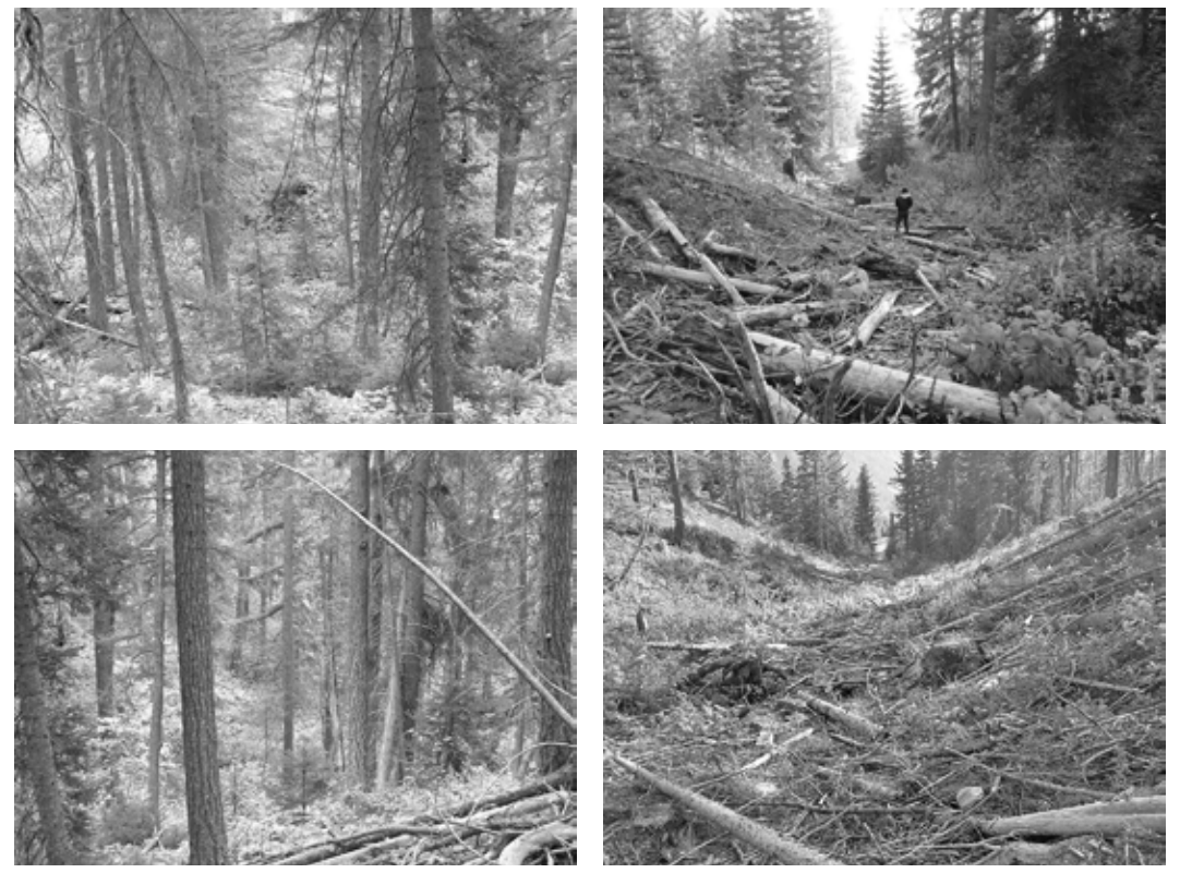
Figure 3. Riparian forest before (left, 2006) and after (right, 2013) logging at the south-facing tributary of the Hurley River where Coastal Tailed Frog tadpoles were found on 5 October 2006.

The possible elimination of Coastal Tailed Frogs from the south-facing tributary may represent a further range contraction of the species in the Bridge River watershed. In 2000, Leupin (2000) reported tadpoles lower in the Bridge watershed in Tommy Creek, a tributary of the Bridge River flowing into the south side of Carpenter Lake, and in the upper reaches of Shulaps Creek, a tributary of the Yalakom River that joins the Bridge River farther east, closer to Lillooet. Coastal Tailed Frogs were not detected